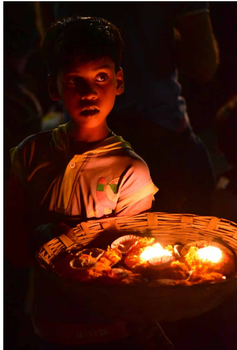
Left to right: Musicians in City Palace; a child sells blessing blossoms on the Ganges

dance in the morning breeze. Spice and coffee scent the air as we climb to the fort's entrance, where the stone path is worn to a polish. The Amber Fort, also known as the Amber Palace, was once home to the Rajput Maharajas and now receives more than 5,000 visitors a day. We join the crowds, emerging into a vast courtyard, one of four, ringed by exquisite Mogul and Rajput architecture in pale yellow. Ancient fortifications cling to the surrounding mountain slopes like scales as they lead up to the Jaigarh Fort, built atop Cheel ka Teela, the Hill of Eagles, to protect the royal residence below. From the ramparts above the Amber Palace's Diwan-e-Khas , the Hall of Private Audience, children peak through