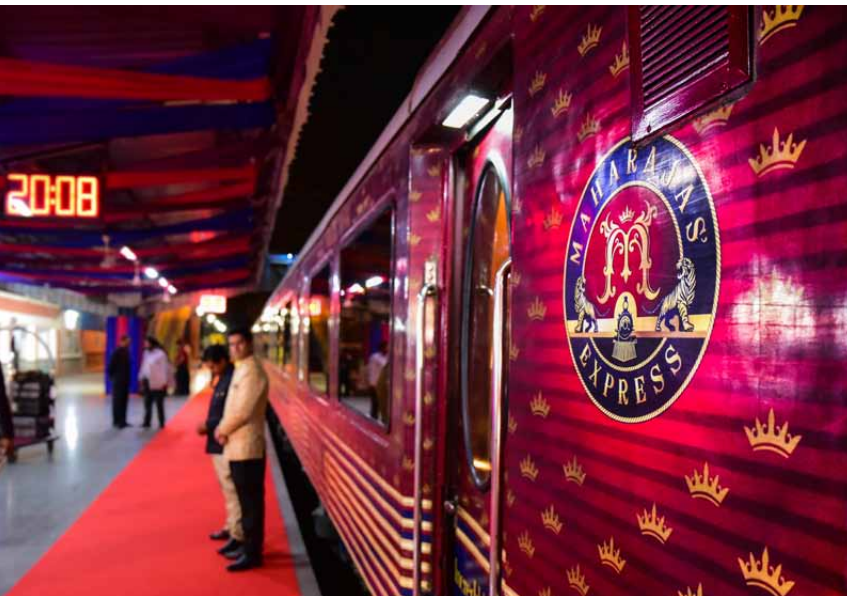
Clockwise from top left: The Maharaja's Express is regularly awarded best train journey in the world; an unforgettable reception in Jaipur; a spacious double stateroom