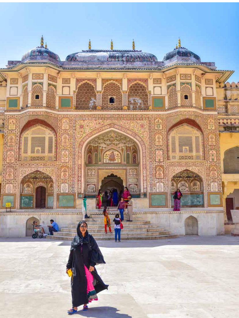
Clockwise from top left; the Ganges at dusk; local guides accompany the train; the Unesco-listed Amber Palace